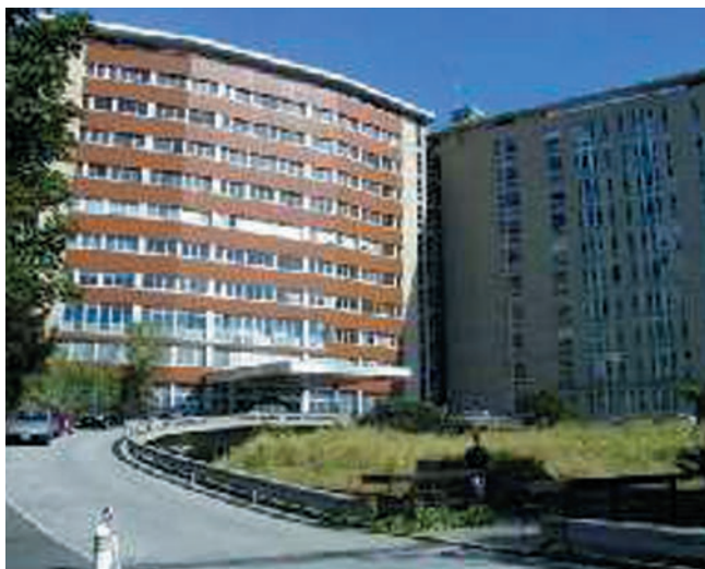
Figure 1. S. Paolo Hospital in Napoli, Italy.

co-pay classes (A, B, and C). Class A includes drugs for essential and chronic diseases that are covered by the NHS except for a minimal flat contribution by the patient (the so-called “ticket”). Class B consists of other drugs satisfying primary therapeutic requirements whose cost is shared at 50% by the consumer. Class C includes all other drugs that: (1) have no clinical documentation supporting their efficacy; (2) are more costly than class A drugs; (3) are used to treat minor or inexpensive illnesses; and (4) do not require a prescription. Consumers are responsible for the total cost of class C drugs. 28